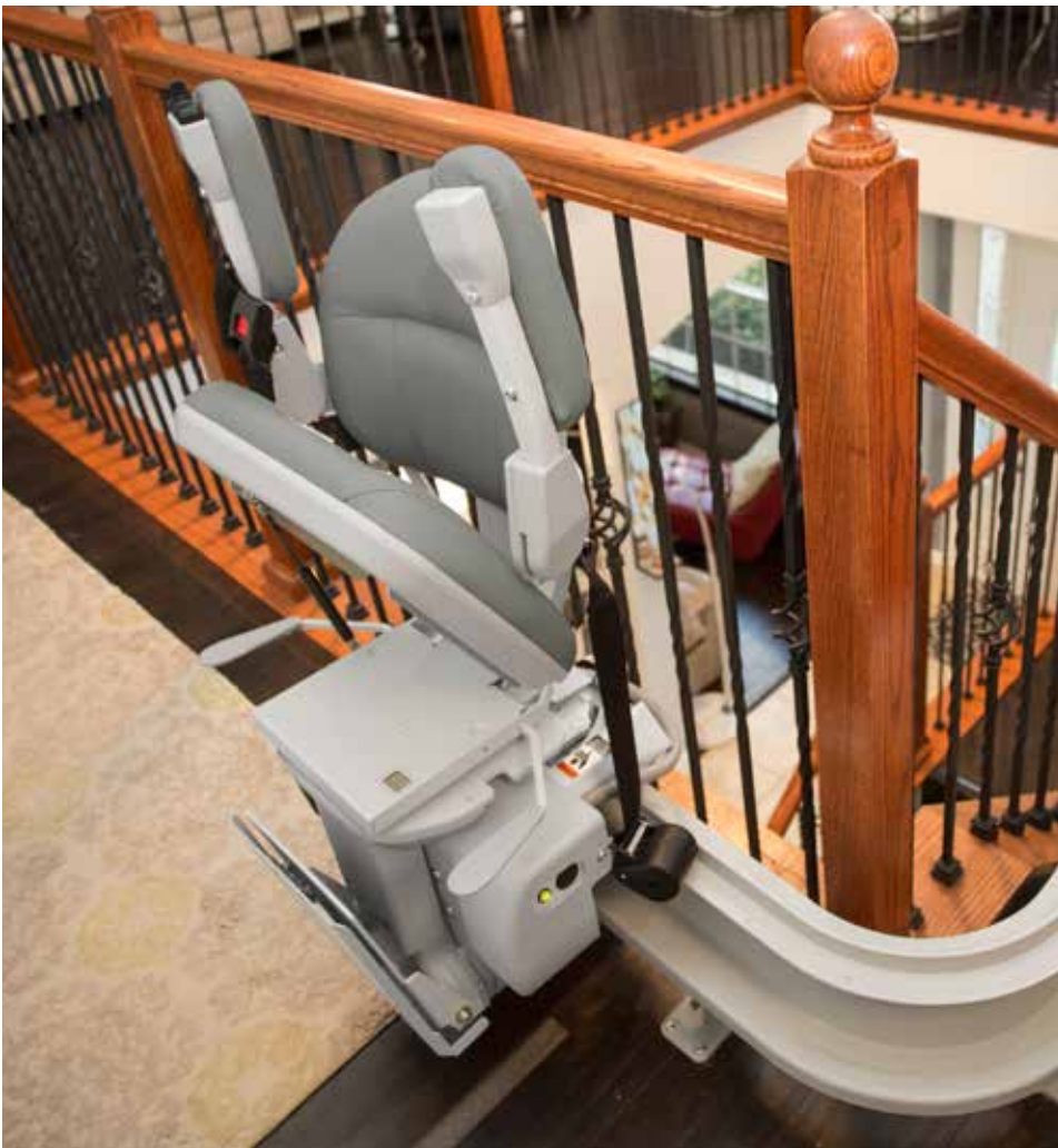
Custom made specifically for your home.