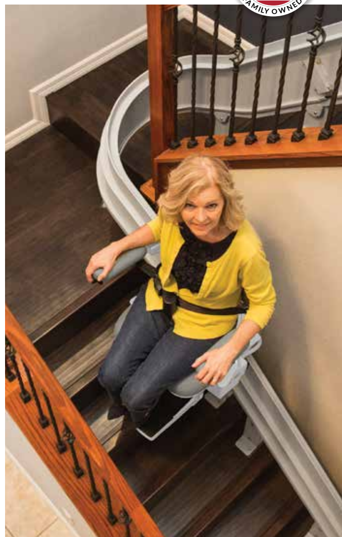
Crafted for a precision fit around curves.