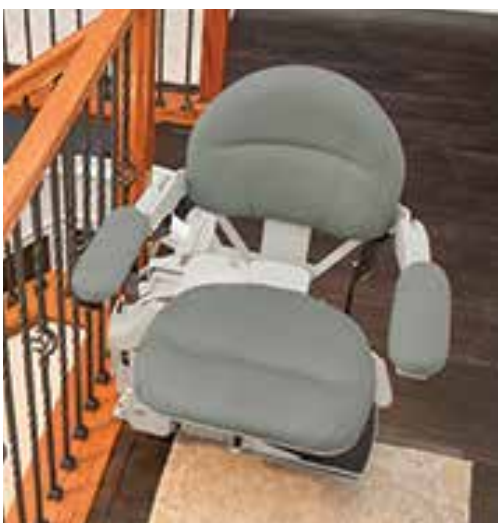
Offset swivel seat makes it easy to get on/off.