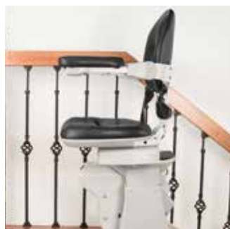
Power swivel seat. Control on chair armrest or wireless call/send.