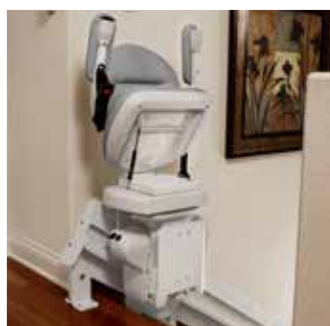
Power folding footrest flips up/down when seat is raised/lowered.