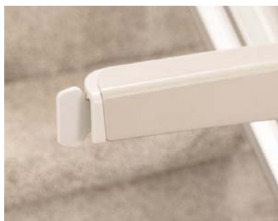
Ergonomic armrest control.