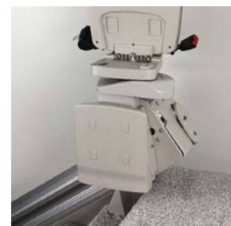
Power folding footrest automatically flips up/down when seat is raised/lowered. Arm switch control optional.