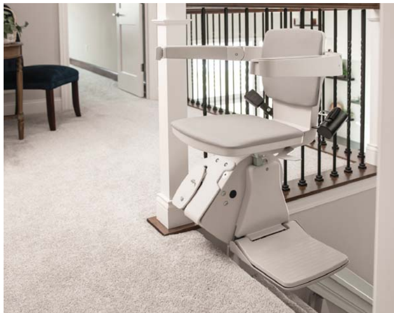
Offset swivel seat makes getting on/off easy.