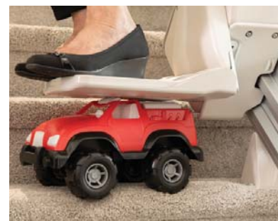
Sensors ensure safety.