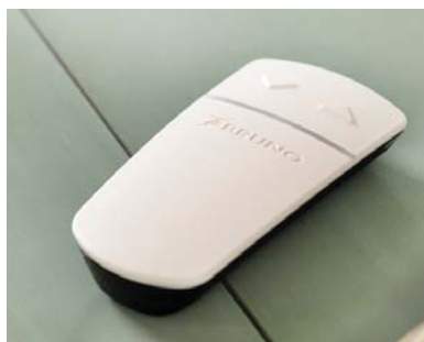
Two wireless call/sends allow remote control access.