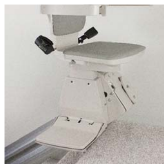
Power swivel seat for effortless exit. Armrest switch control or wireless call/send.