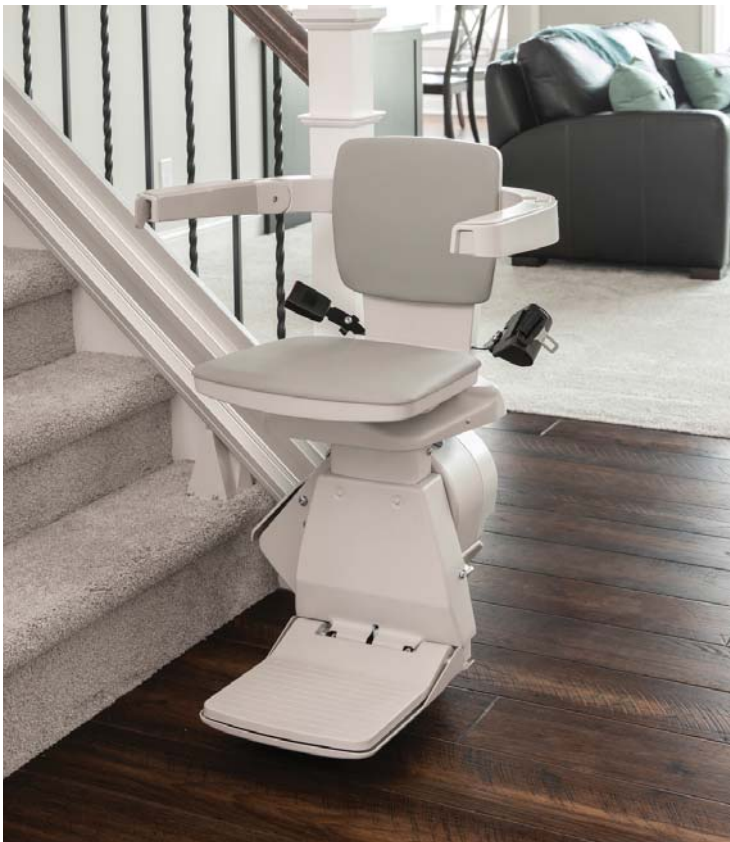
Padded, generous-size seat.