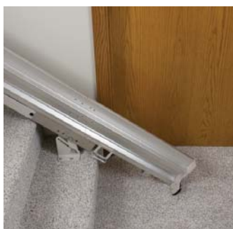
Manual or power folding rail for narrow hallway or when doorway is at the bottom of stairs. Manual operation or push button automatic.